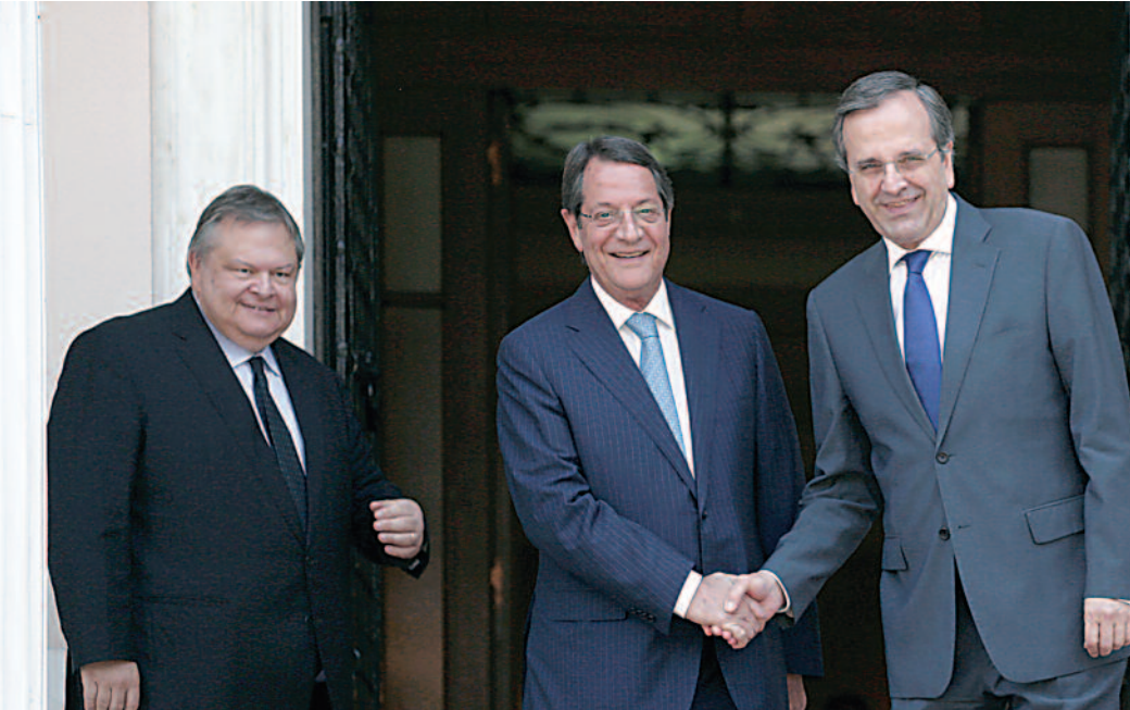
Pictured Left to Right: Greece's Deputy Prime Minister and Foreign Minister Evangelos Venizelos, Cyprus President Nicos Anastasiades, and Greek Prime Minister Antonis Samaras.

In May, Turkey said it wouldn't pay $123 million in damages to Cyprus that was ordered by Europe's top human rights court. The furious Turks said it was a big blow to peace talks on the island and refused to recognize the order of a court despite its EU ambitions.